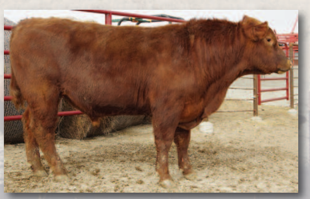
Giefer Impression B523 • Lot 12