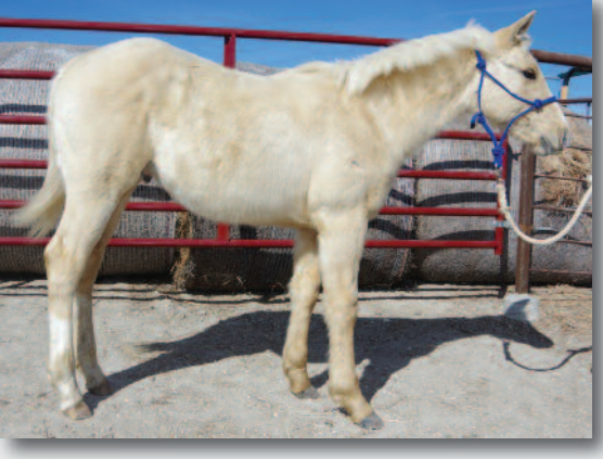
GQ Mr Flash • Lot 52

Color/Markings: Palomino dun, blaze, hind stockings