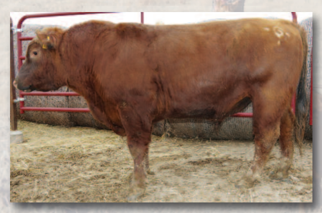
Giefer Impression B572 • Lot 16