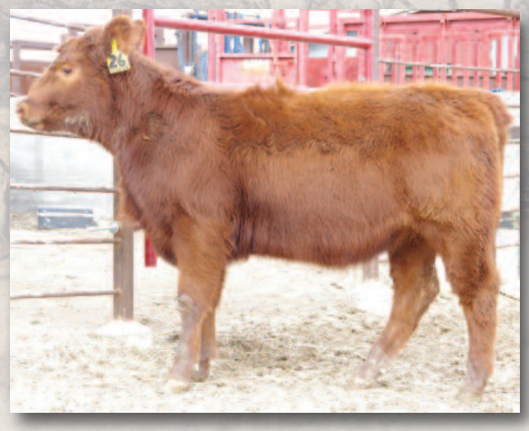
Giefer Cottonwood C026 • Lot 33