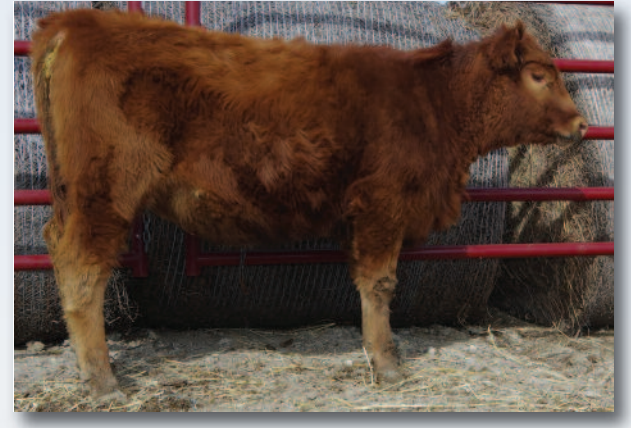
Giefer Copper Penny C108 • Lot 39