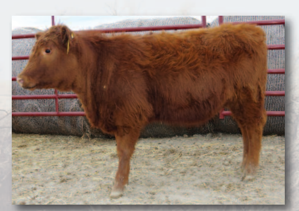
Giefer Smoky Hill C081 • Lot 36