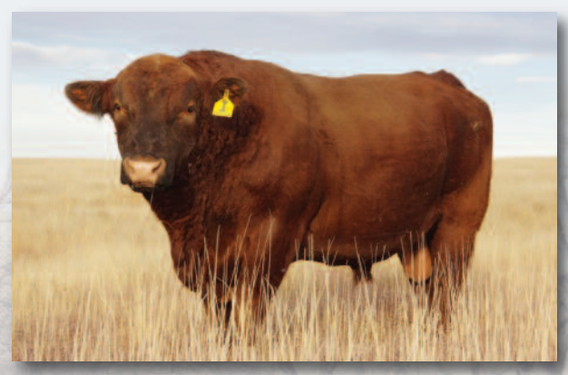
Mushrush Impression X381