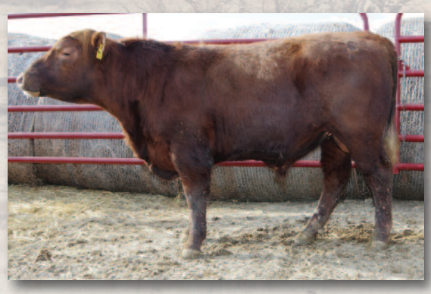
Giefer In Focus B575 • Lot 31