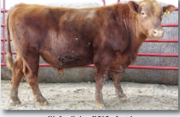
Giefer Orion B505 • Lot 1