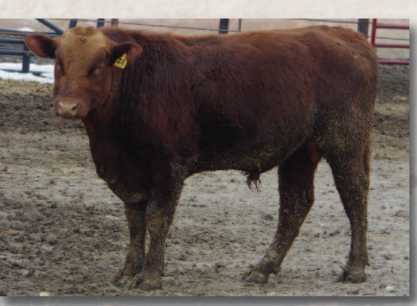
Giefer Orion B528 • Lot 4

Grid CED BW WW YW Milk ME MARB YG CW 118 50 11 -5.4 44 72 20 3 9 11 0.52 0.03 5 -0.05 0.01 32% 23% 9% 4% 88% 78% 43% 64% 66% 24%