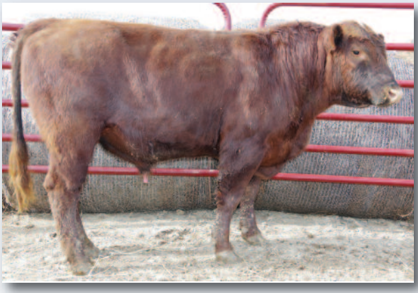
Giefer Impression B501 • Lot 9