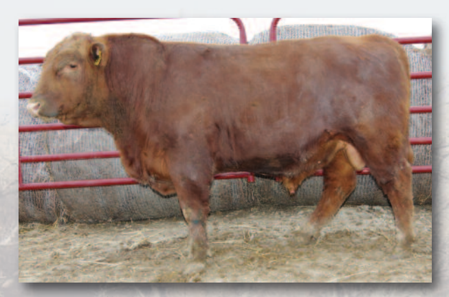
Giefer Impression B553 • Lot 14