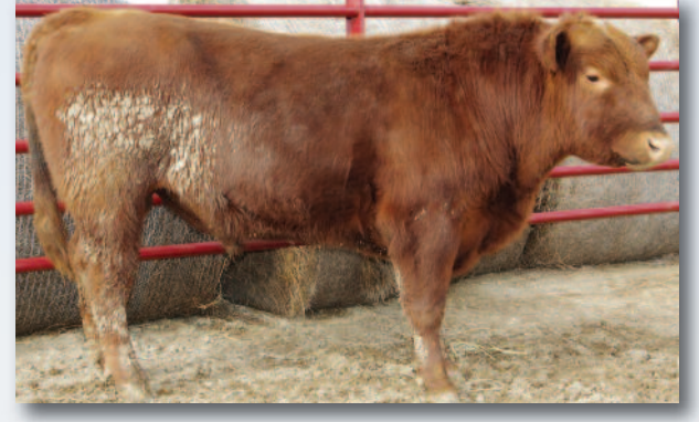
Giefer Impression B590 • Lot 17