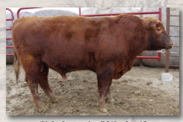
Giefer Impression B569 • Lot 15