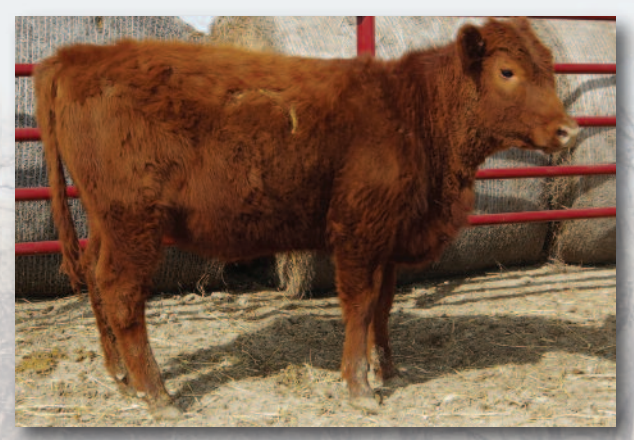
Giefer Shawnee C001 • Lot 40