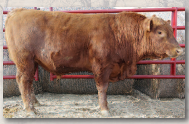
Giefer Impression B513 • Lot 11