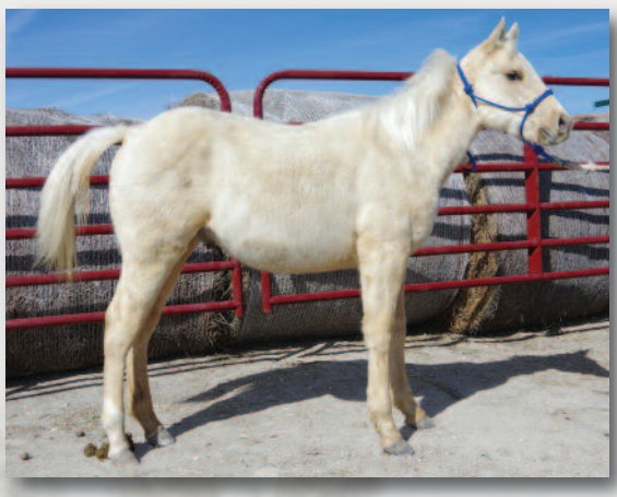
GQ Snowman • Lot 49