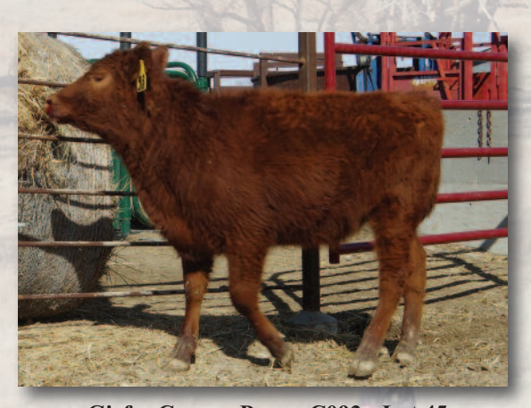
Giefer Copper Penny C093 • Lot 45