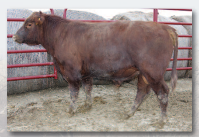
Giefer In Focus B554 • Lot 30