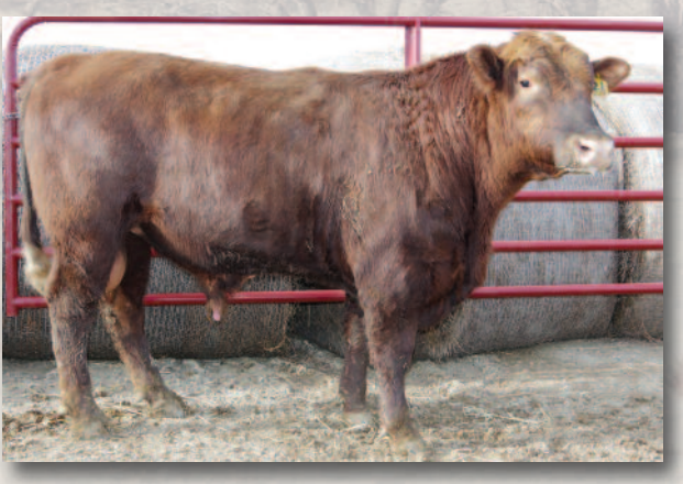
Giefer In Focus B521 • Lot 27