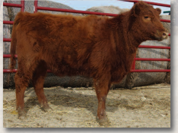
Giefer Shawnee C043 • Lot 41

Grid Master CED BW WW YW Milk ME HPG CEM STAY MARB YG CW REA FAT 51 9 -2 62 98 24 -1 10 5 0.6 0.07 25 0.19 0.03 30% 28% 15% 35%