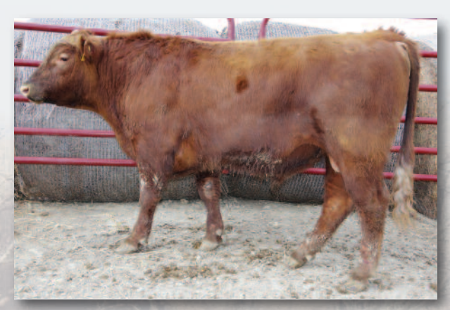
Giefer Orion B555 • Lot 6