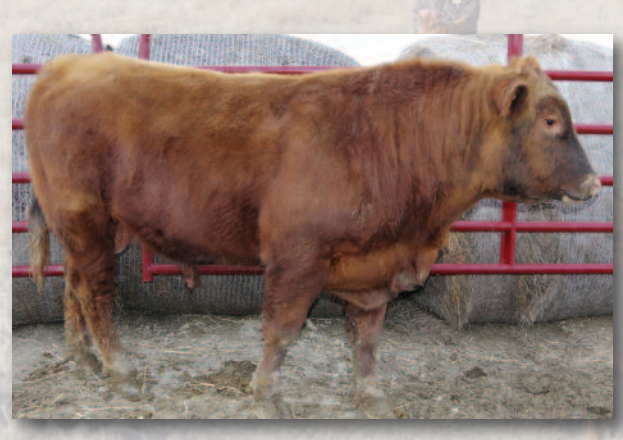
Giefer Orion B603 • Lot 8