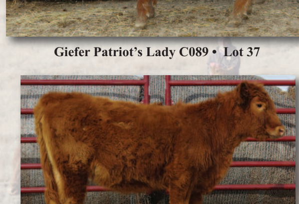
Giefer Redbud C096 • Lot 38