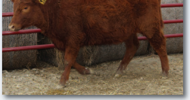
Giefer Redbud C097 • Lot 47

48 GIEFER MEADOWLARK C110 Reg. # Calved Tattoo Category BW BR WW WR Open Heifer 3505736 05-04-15 C110 GIEF 1A 100% AR 79 104 541 108