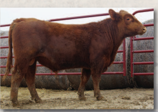
Giefer Paramount B531 • Lot 20