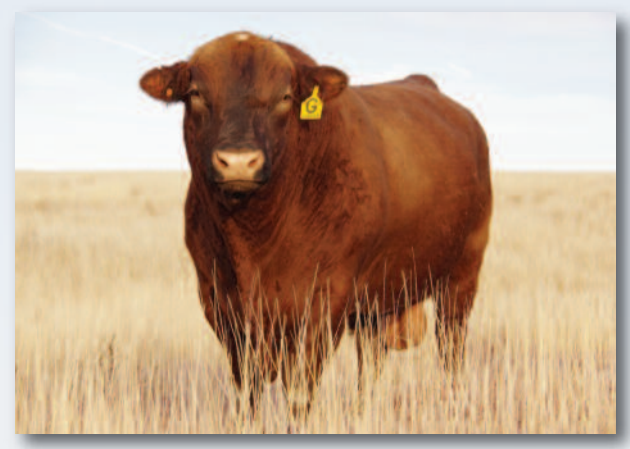
BUF CRK Orion W011