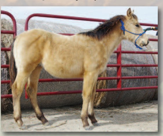
GQ Lance Kilkenny • Lot 55

Color/Markings: Buckskin, star, right hind pastern