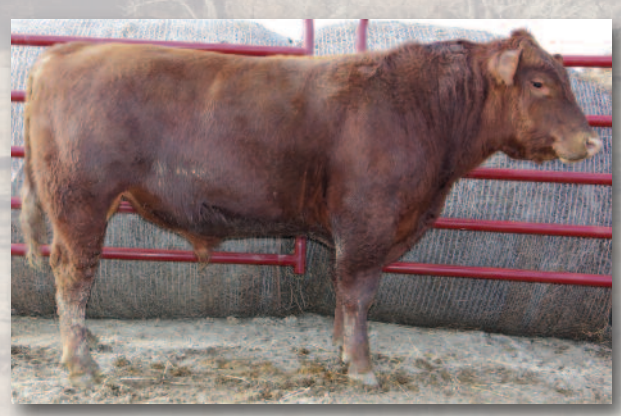
Giefer Paramount B557 • Lot 23