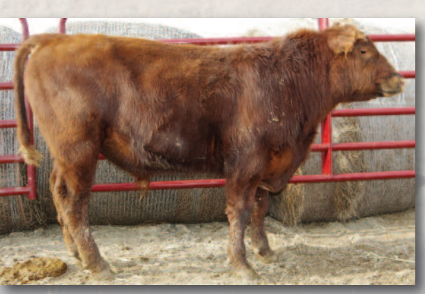
Giefer In Focus B524 • Lot 28