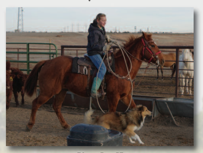
Plug • Lot 57