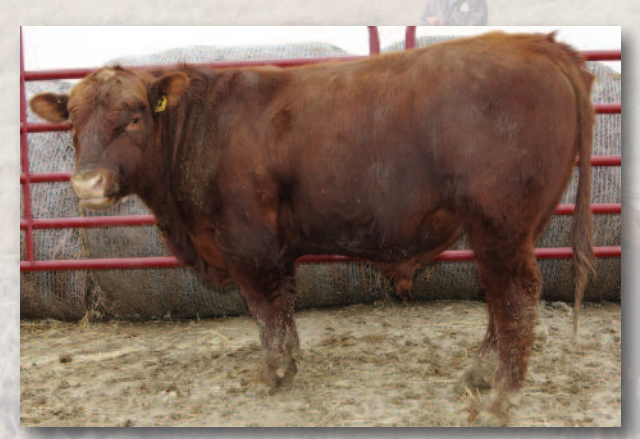
Giefer In Focus B502 • Lot 24