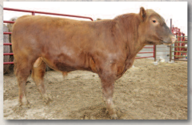
Giefer Paramount B527 • Lot 19