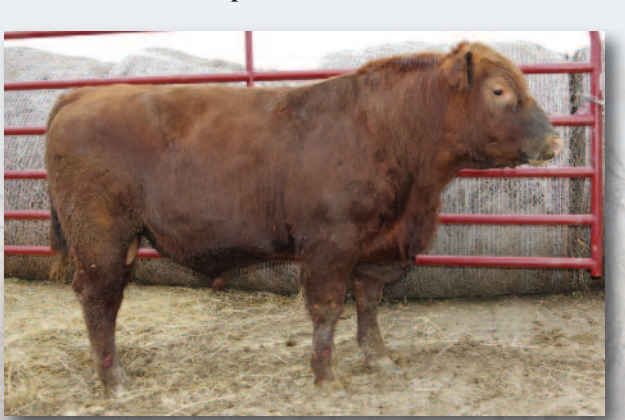
Giefer Impression B599 • Lot 18