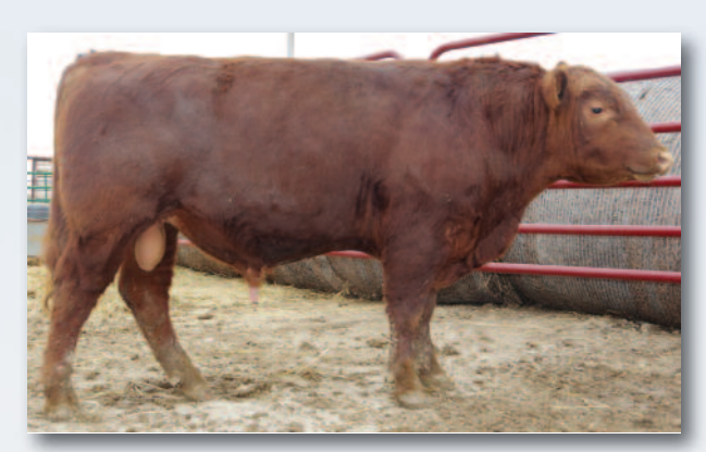
Giefer Impression B551 • Lot 13