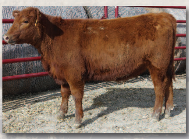
Giefer Cottonwood C050 • Lot 42