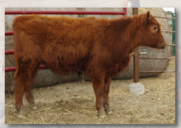
Giefer Cottonwood C094 • Lot 46