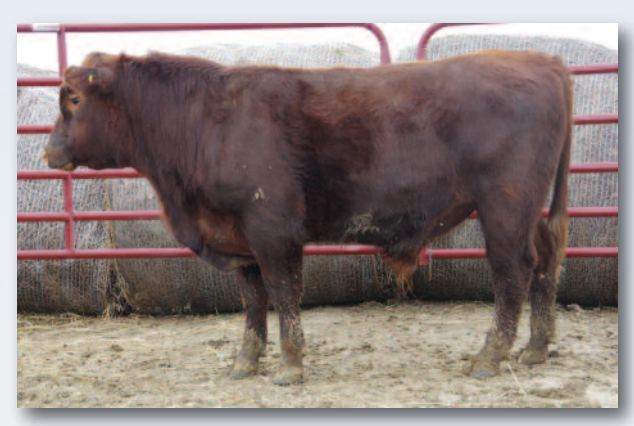
Giefer In Focus B537 • Lot 29