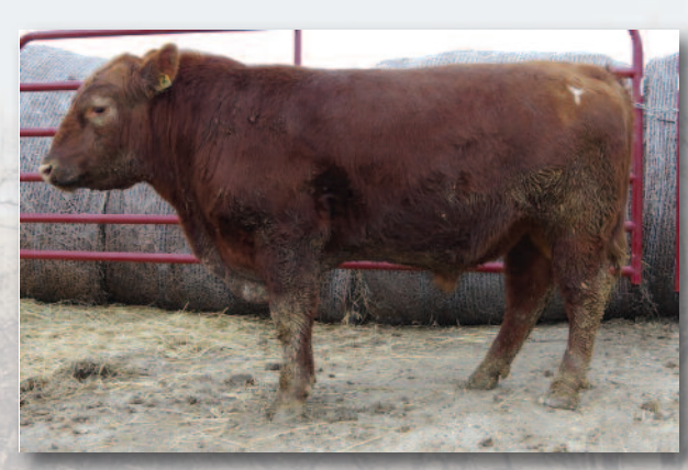
Giefer Impression B512 • Lot 10