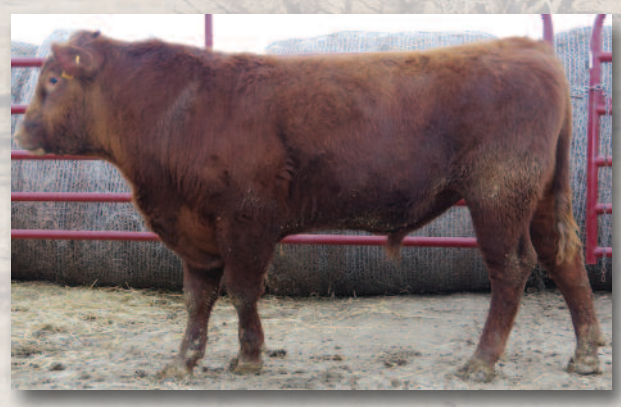
Giefer Orion B566 • Lot 7