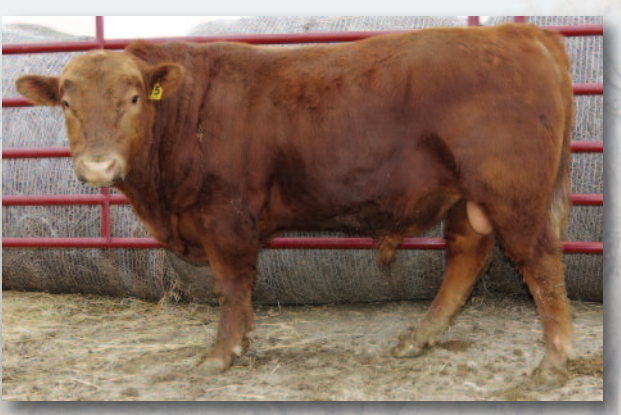
Giefer Orion B515 • Lot 2