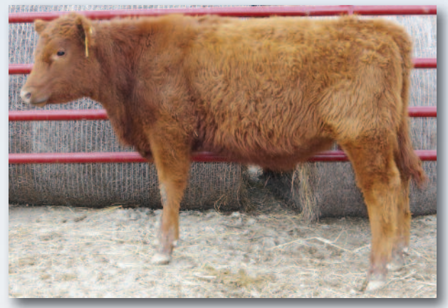
Giefer Cottonwood C085 • Lot 35