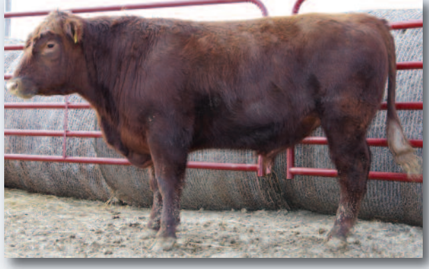
Giefer In Focus B508 • Lot 25