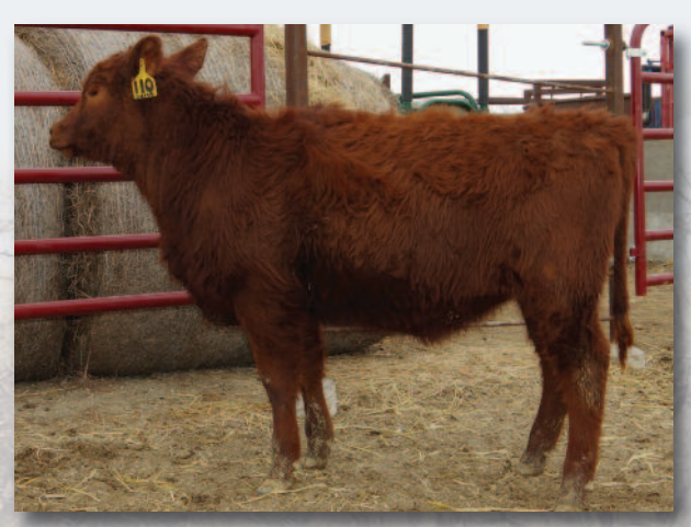
Giefer Meadowlark C110 · Lot 48