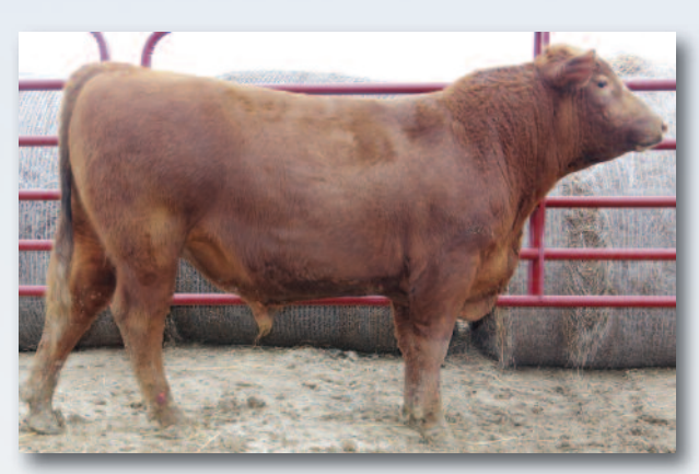
Giefer Orion B543 • Lot 5