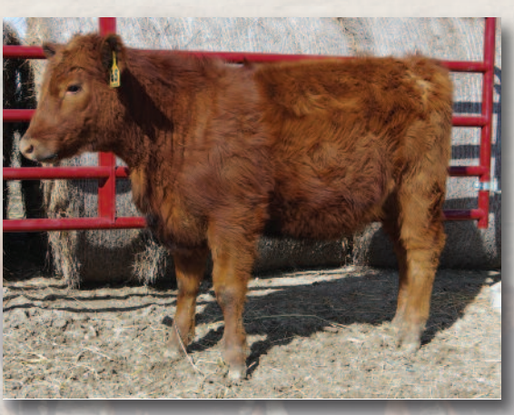
Giefer Ruby Slipper C065 • Lot 34