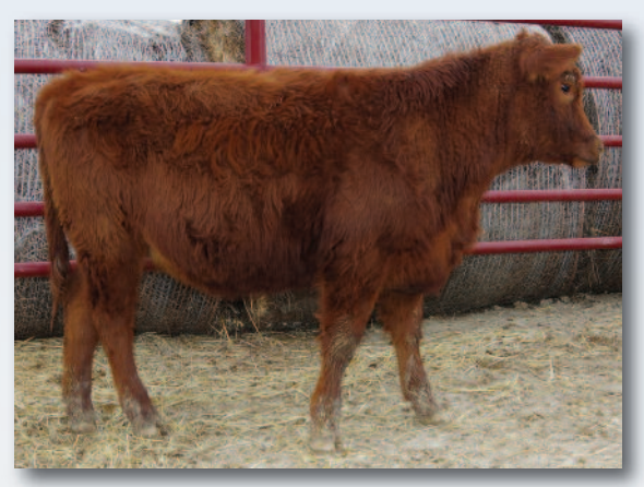
Giefer Cottonwood C064 • Lot 43