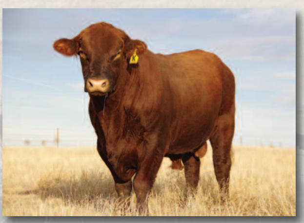
Andras In Focus 1158