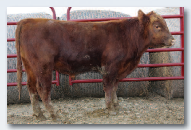
Giefer Paramount B532 • Lot 21