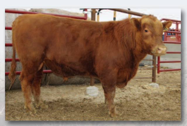
Giefer Paramount B545 • Lot 22