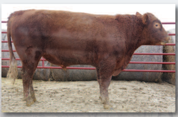
Giefer In Focus B510 • Lot 26