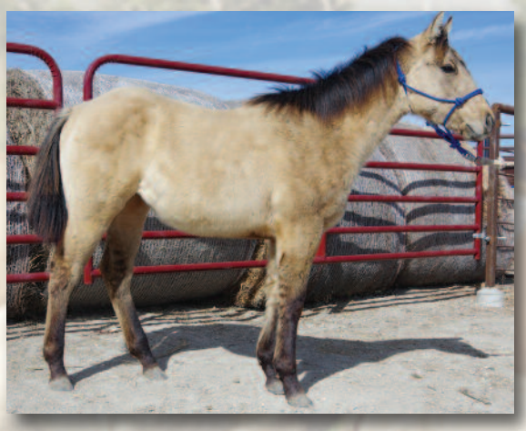
GQ Turbo Doc • Lot 50

Color/Markings: Palomino dun, star, strip, snip, right hind sock