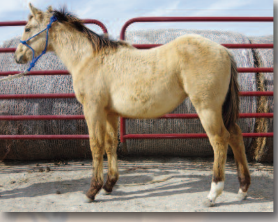
GQ Zands Squirmy • Lot 54

Color/Markings: Busckin dun, star, hind pasterns