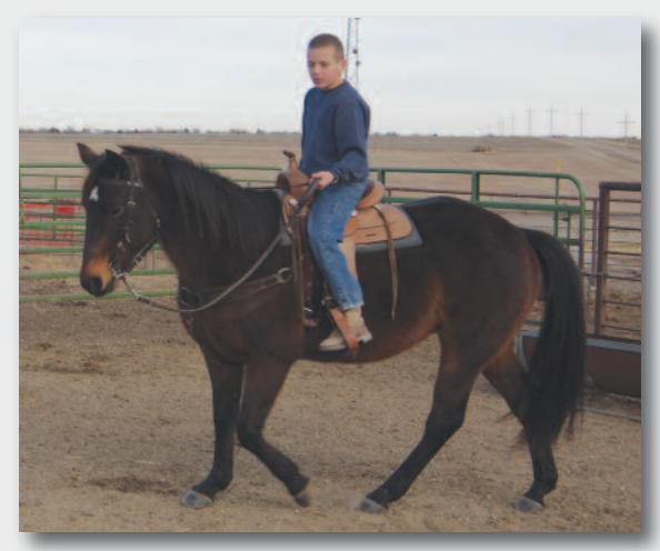
Ms Fancy Deck • Lot 56