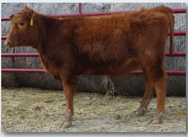
Giefer Patriot's Lady C067 • Lot 32