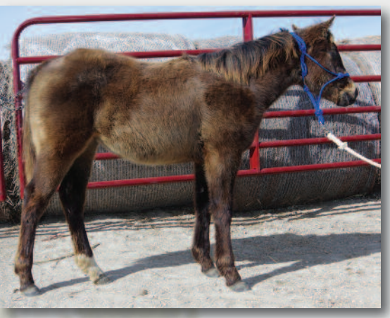
GQ Spot A Horse • Lot 53

Color/Markings: Smoky black, star, snip, left hind pastern